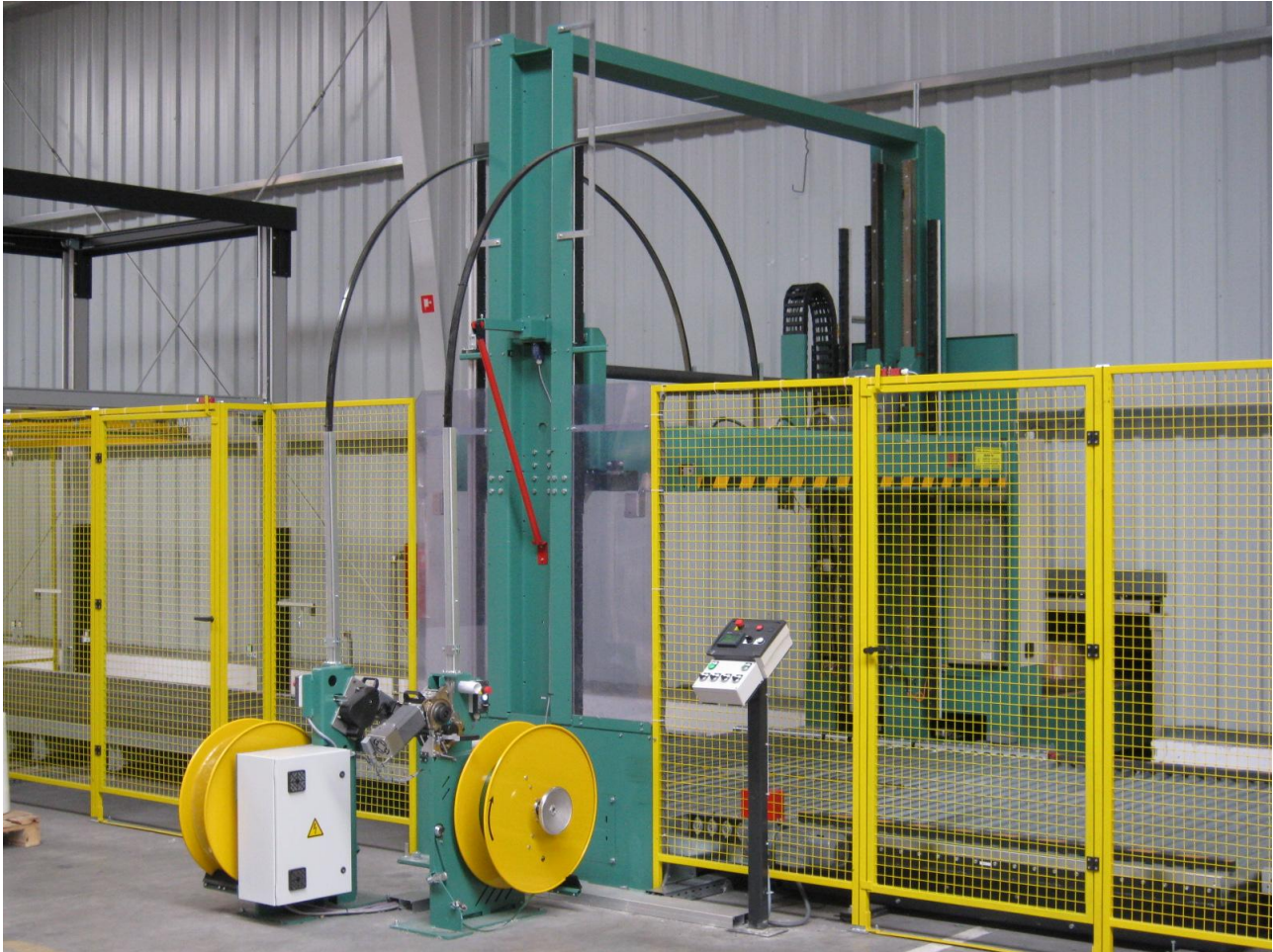
The GCU-2500 integrated into a Signode pallet packaging line including roller conveyors, optional load turntable and Signode Octopus stretch-wrapping equipment and Signode safety system, guarding supplied as a complete turn-key project. Equipped with telescopic strap chutes to accommodate varying load heights, the loads can be compressed and strapped at any height without affecting the packaging line throughput