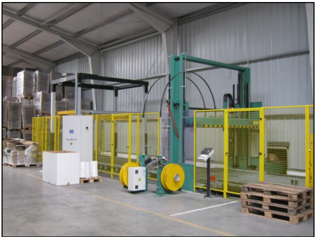
Another line overview with press and Octopus stretch wrapper in a delivery which was integrated in a new packing line for improved packaging performance