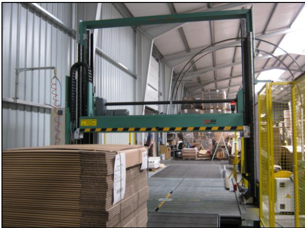
GCU 2500 machine platen with electrical frequency drive and twin telescopic strap chutes. Machine has the new powered strap dispensers with auto strap re-feed system