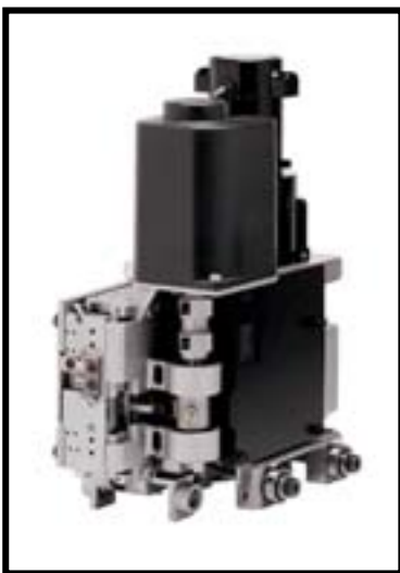
Sealer Module weighs only 18 kg

Z20 Model shown installed on a hydraulic lumber press. The modular system with one of the lowest TCO ratings, is the optimum solution for today's lumber plants with high production throughputs.