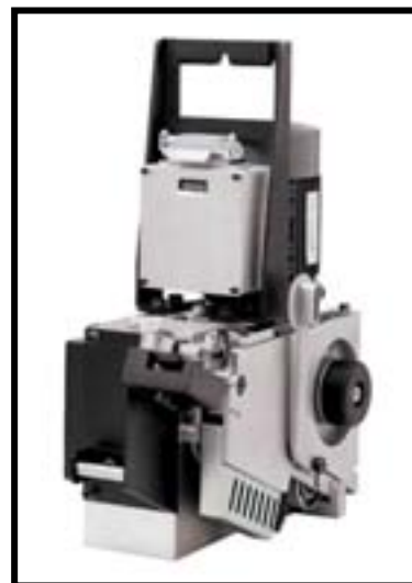
Strap Feed & Tension Module weighs 32 kg