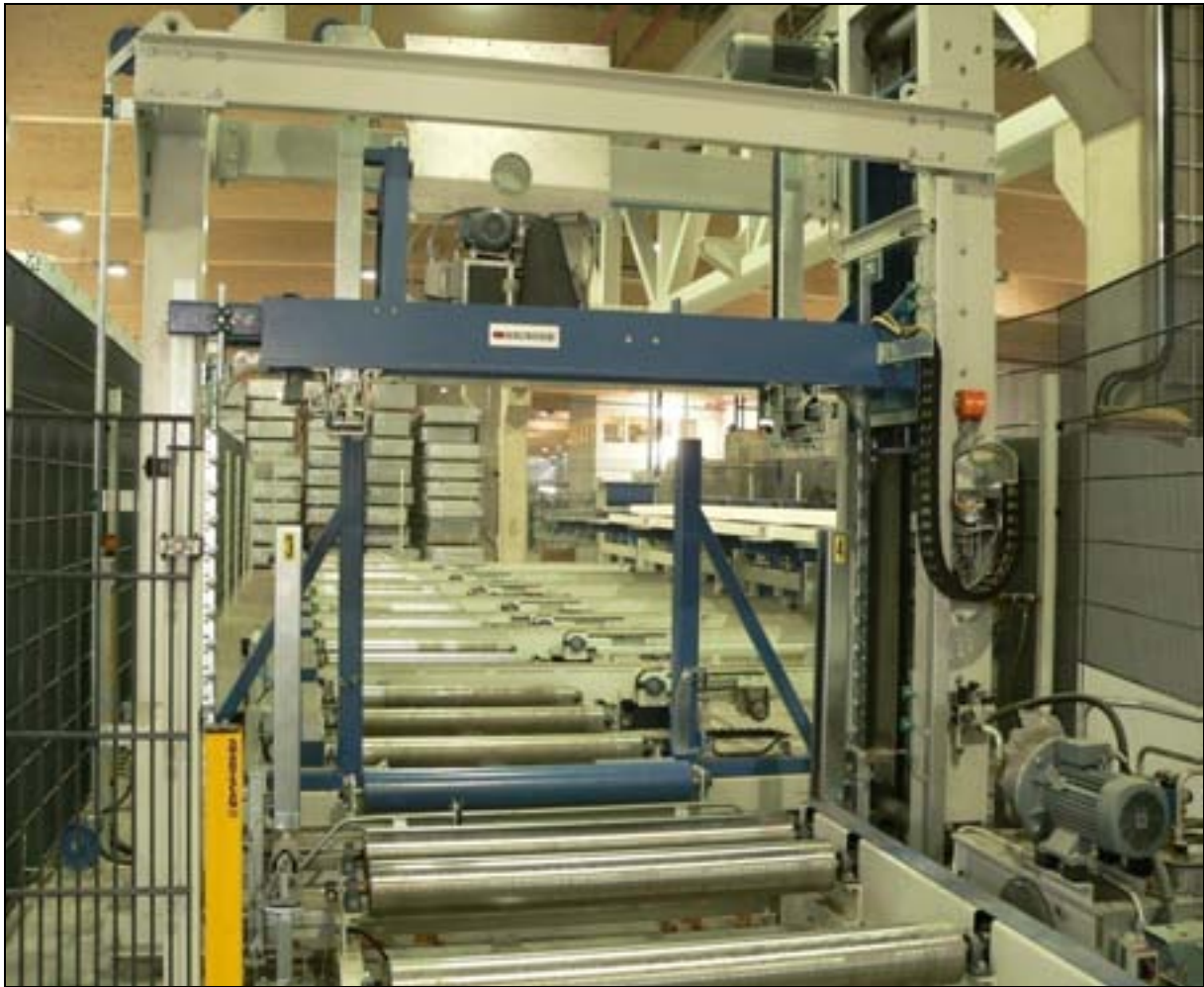
Model shown with hydraulic load side-squaring arms and top and bottom edge-protector applicators.