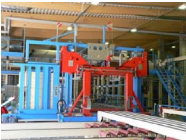
Model shown with top edge-protectors & bottom batten magazine feeder